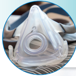
CPAP Mask & Tubing