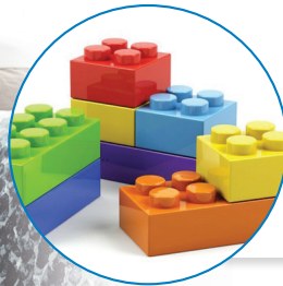
Toys... and much more!

Cleans and sanitizes your everyday items